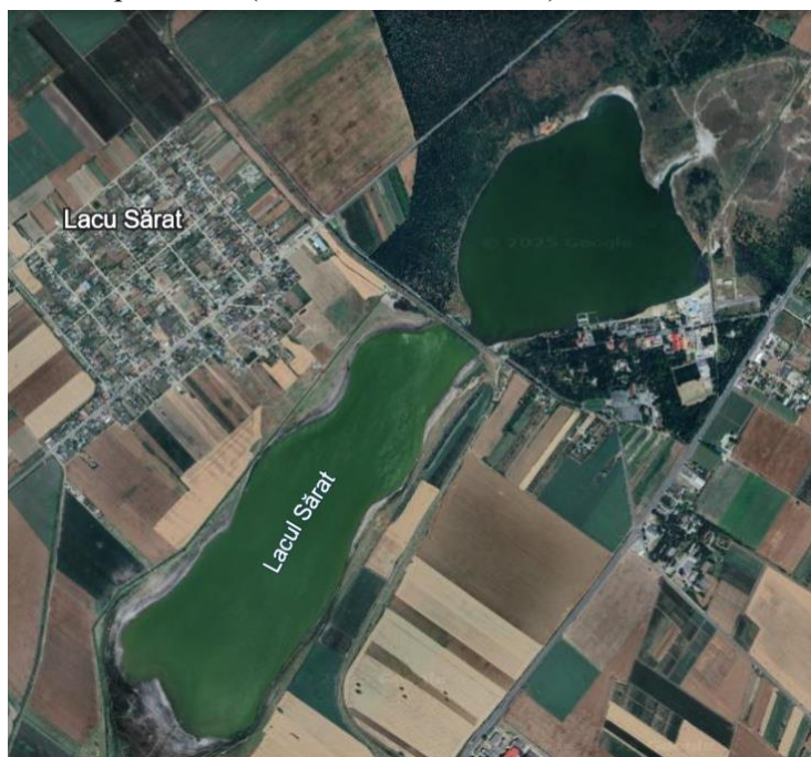
Figure 1. Location map – Lacu Sărat I and Lacu Sărat II

A distinct category of surface waters in the analysed area is the therapeutic salt lakes, with sapropelic mud deposits, represented by Lacu Sărat (Brăila) and Movila Miresii (PATC Lacu Sărat, 2024). Lacu Sărat, located at an altitude of 16 m, was formed in an old course of the Danube, which was later covered by loess deposits; the lacustrine depression resulted from loess subsidence processes (Maiorescu et al., 2018).