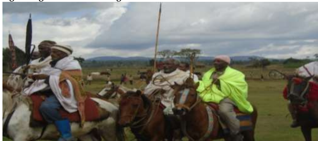
Fig 3: Gugsii Raabaa (Riding Horse at Raabaa ritual)

Along line the decision of leaders and pervasively practiced, the first step is Korma Walargii . As it understandable from its name Korma Walargii is the official opening of the Raabaa ritual. After they slaughter korma walargii stake Xiribbaa and Jila bulchuu . This small peg is the symbol of ownership and the mechanism of avoid bad spirit from community. During that night all gosaas (clans) and Baallii participate in blessing one another and praying waaqaa for peace, unity and fertility. Then in the early morning they move to ritual site and practice 'sirna ulee dhabbannaa' the ceremony of ritual stick.