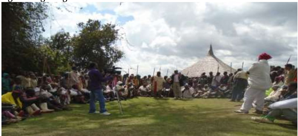
Fig 2: The get-together of Raabaa ritual

Raabaa's process has various sequential and remarkable steps. According to data gathered from FGDs the basic step to practice Raabaa ritual is the discussion and decision among Abba Bokku, Abba hookka and saddetta about setting of Raabaa and what ought to be or not. Even though it is not obligation, others would also participate and share their ideas and details. To sum up, discussing and deciding about how, when, where, who, whom, and what should be taken on the upcoming Raabaa by front runners and/or leaders is a typical and considerable fundamental stage in the Raabaa processes.