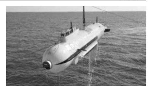
Fig.6. Image The AUV Daurade by SHOM

In the field of oceanography and hydrography, AUVs are used to perform various measurements or to map the seabed. Thus, the SHOM (Hydrographic and Oceanographic Service of the Navy) has an AUV, called Daurade, which is dedicated to REA (Rapid Environmental Assessment) missions (see Fig. 6 below).