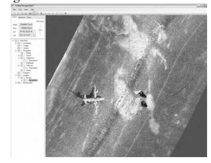
Fig.5. Image of plane wreckage obtained by post-processing of sonar signals

Most early underwater robots were equipped with cameras, and these are still the most commonly used sensors for ROVs to-day. However, the cameras can only be used near the objects to be observed or to work on. The turbidity of the waters and the absence of light (the range of projectors remains limited to a few tens of centimeters) considerably limit their usefulness. It is therefore the sonar (ultrasonic detector) that is the most suitable sensor for remote "vision", in an almost opaque environment. Like a radar, sonar makes it possible to designate a target, "hang on" it and follow it.