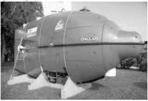
Fig.1. The Killer Whale

How to explore such large expanses in such a hostile environment? How to exploit deposits under several hundred bars of pressure, when a man cannot access them? The answer to both questions is the underwater robot. The idea is not new: as early as the 1970s, remotely operated robots made it possible to destroy underwater mines without exposing human lives, and in the mid-1980s, the Killer Whale (see Fig. 1), an autonomous robot developed by ECA, explored the wreck of the Titanic liner, stranded at a depth of 3,800 m, in the North Atlantic.