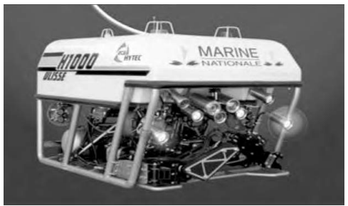
Fig.3. The ROV 1000, intervention robot of the French Navy

of which is limited either to observation or to short-term missions.