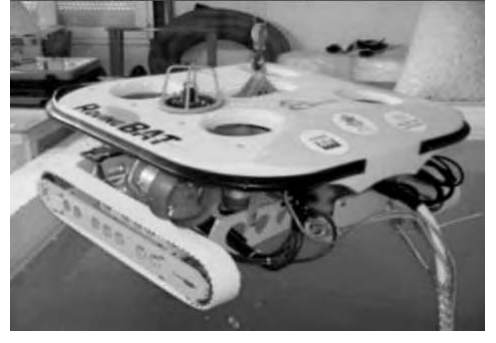
Fig.7. The ROV Roving Bat

It is the field of civil security that undoubtedly contributes the most to the media coverage of these new technologies. The search for wrecks, damaged aircraft at sea and their flight recorders are the best known aspects of this (as we have already mentioned in connection with the search for the black boxes of flight AF 447 Rio-Paris or more about the air disaster in Sharm El-Sheikh, Egypt). However, other applications have emerged, for example, the National Gendarmerie frequently uses a ROV when searching (in bodies of water) for missing persons, and EDF uses small ROVs to inspect the pools of its nuclear reactors and its hydraulic dams, in order to verify the absence of anomalies.