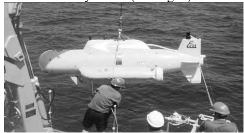
Fig.8. The PAP, implemented on a minehunting vessel

In the following, a few words about the military applications that finance a good part of the R&D necessary for the development of these robots. The oldest use is that of mine warfare. Many underwater mines have been (and still are) laid by the States to protect or prevent access to sensitive areas: ports, military installations, access channels, sea passages. The most modern mines, reacting to acoustic or magnetic signatures of ships, are not very accessible to dredging techniques. More than forty years ago, the idea was born to send robots to neutralize them. One of the first of these robots to be used was the PAP (Poisson Self-propelled Piloté) developed by ECA in the early 1980s (see Fig. 8).