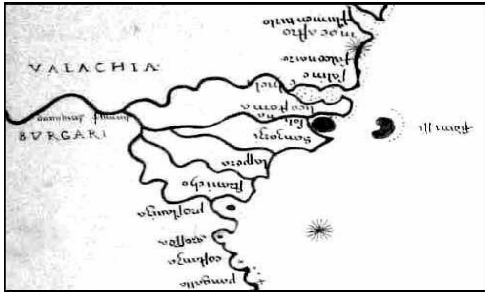
Fig. 3. A fragment of the map of Black sea MARE PONTICUM SIVE PONTUS EVXINVS. Genoa, XVI century.