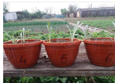
Fig. 2. Variant V2 - the initial seeding phase