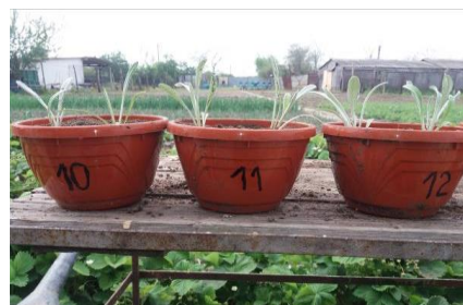
Fig. 4. Variant V4 - the initial seeding phase