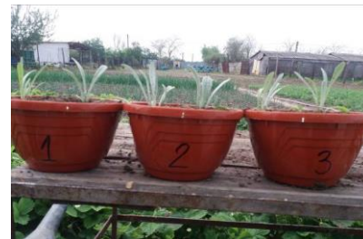
Fig. 1. Variant V1-the initial seeding phase