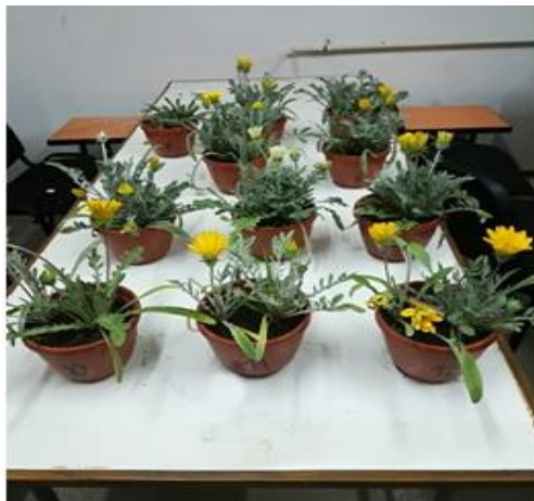
Fig. 11. Variant 1, 2, 3, 4 - end of growing season

For the four plants the following growth - related parameters of the plants of Gazania Talent Yellow were evaluated: