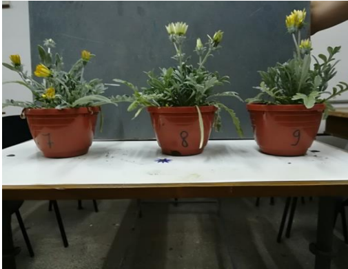
Fig. 9. Variant V3 - end of growing season