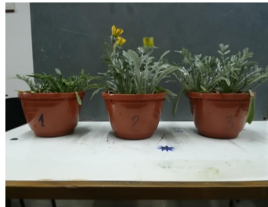
Fig. 7. Variant V1 - end of growing season

At 50 days after planting, four representative flowerpots were selected from the four variants, namely flowerpot 2, 6, 8, 12, and a typical plant from each flowerpot was selected.