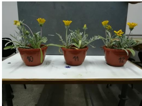
Fig. 10. Variant V4 - end of growing season