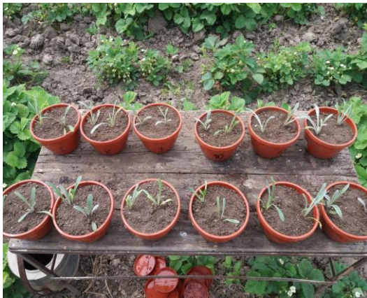
Fig. 5. Variant 1, 2, 3, 4 –overall view of the initial seeding phase

One of the chosen parameters for the comparative assessment of the plants growth rate of the four variants is the plant's epigean part. Thus, after planting the twelve seedlings of Gazania talent yellow, the plant's epigean parts were measured as seen in Table 2.