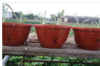
Fig. 3. Variant V3 - the initial seeding phase