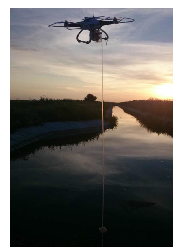
Fig. 5. Collecting water evidence

In Figure 5 is shown how depth measurements were performed and water samples were collected in August of 2019.