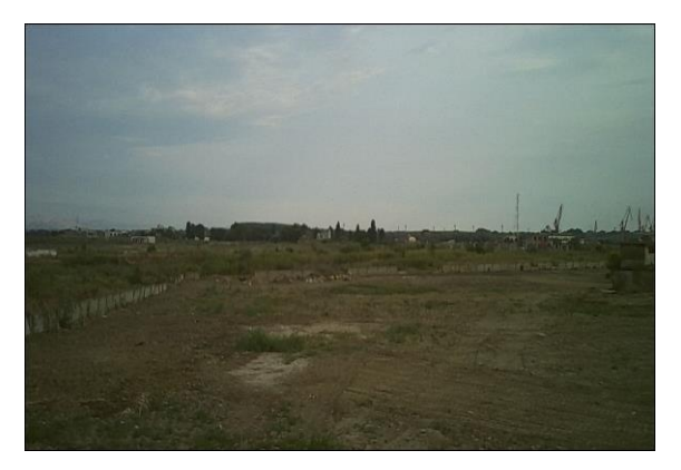
Fig. 3. Video testing on Braila-Galati dam

- the extensive use of the most efficient techniques of geophysical investigation.