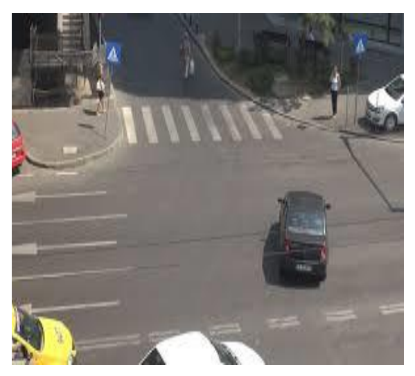
Fig. 6. Determination of traffic noxious