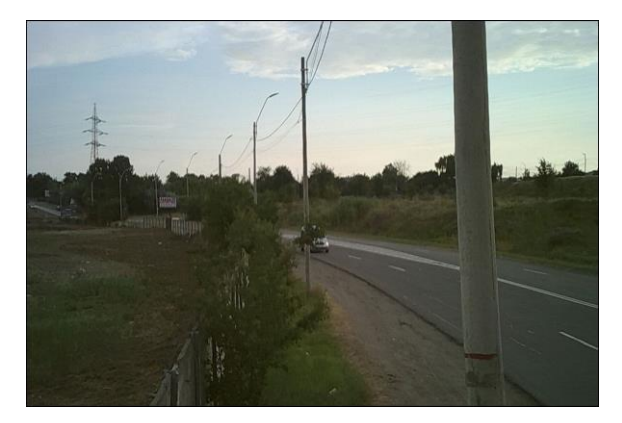
Fig. 4. Video testing on Braila-Galati dam

In Figures 3 and 4 are video images taken from the Braila-Galati dam area, high resolution images that can show aspects needed for experimental research.