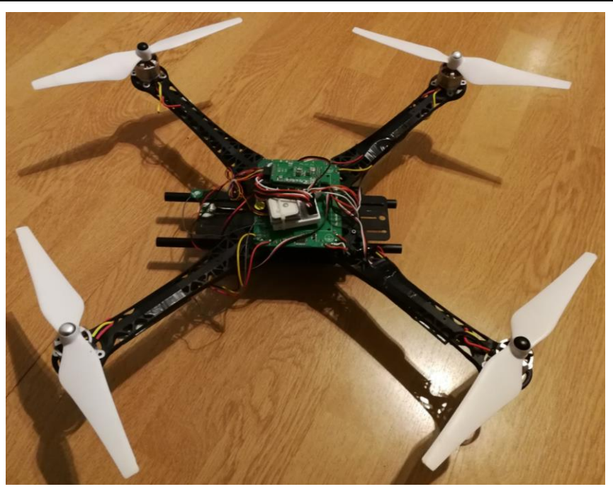
Fig. 2. Drone frame