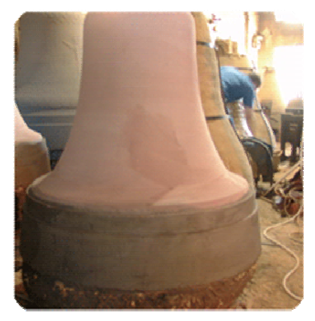
Fig. 2. Fake bell

becomes dry - melts and permits its separation of the fake bell. Before covering the fake bell with a new layer of a clay (which will become the superior part of the casting matrix), this will be decorated with wax ornaments.