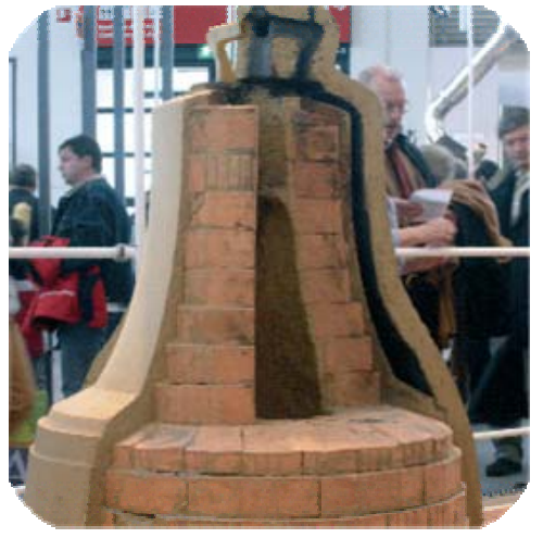
Fig. 1. Core bell

The core is covered with a dust (a layer of grease, in other situations), so the core would not adhere to the surface of the fake bell – the one made of ceramic (or wax, as it was used in older times).