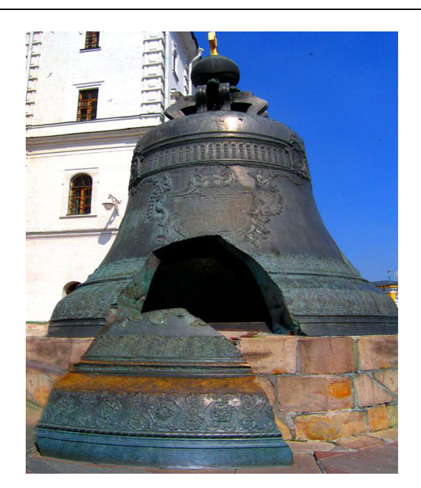
Fig. 3. The biggest bell in Russia and the whole world is the "Tsar's Bell" or "The Empress' Bell", kept in Kremlin. It is put on a pedestal at the base of "Ivan the Great" steeple's tower. Its dimensions and art are still unequaled in the world