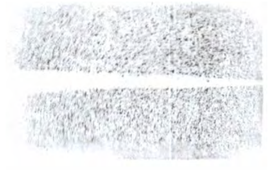
Fig.3. The Baumann amprent of the common link.