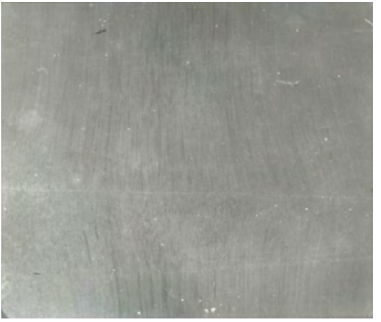
Fig.2. The macrostructure of the commom link, 500:1.

There were dimensional checked 20 pcs common links; 5 pcs enlarged links and 5 pcs end links acc. There were checked all the cable's links at the outer surface and there were no objections (fig.2).