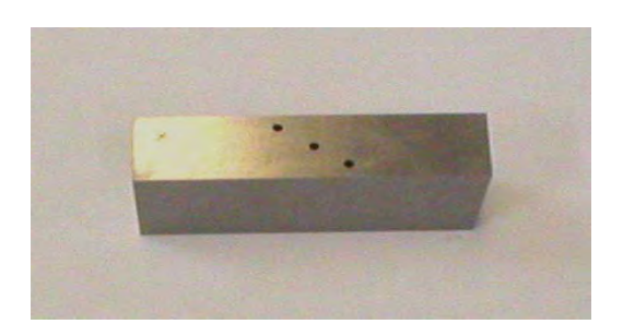
Fig. 2 – Reference block

b. Check and control commonly for all types, as it follows: