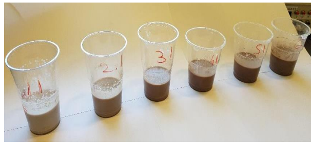
Fig. 5. Volume percentages of clay in epoxy resin