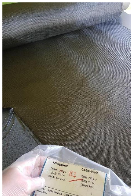
Fig. 1. Carbon fabric with a specific density of 240 g/m 2