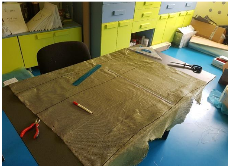
Fig. 3. Cutting high-density carbon-Kevlar fabric at different sizes