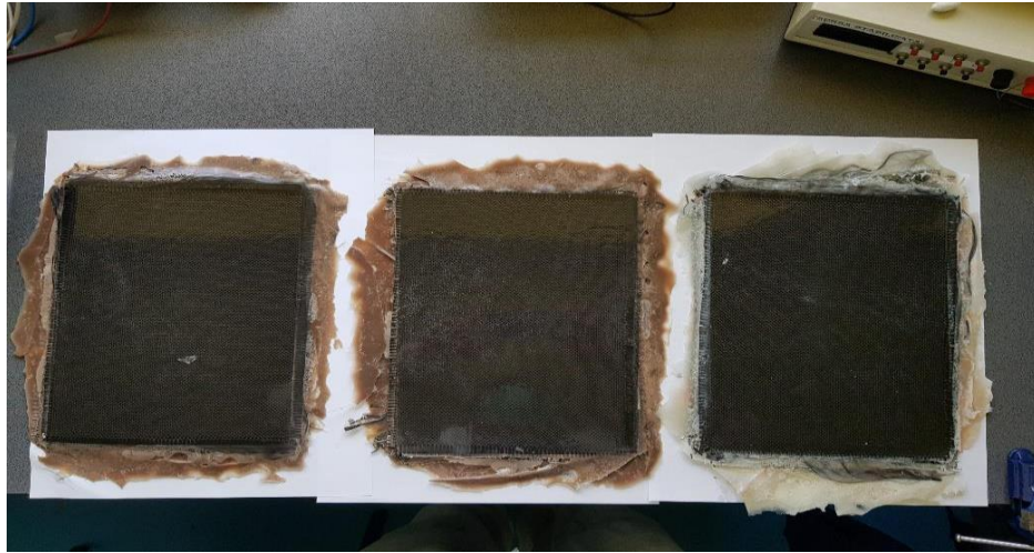
Fig. 6. Formed composite materials