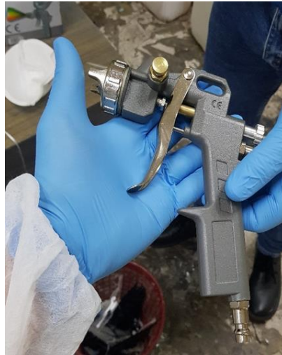
Fig. 2. Sprayer device used to treat glass fibre