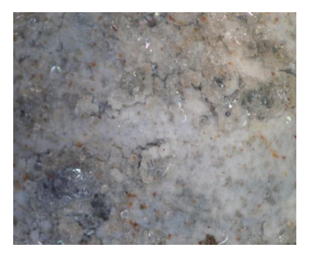
Fig. 4. Sample 5. - Macro view of the stretched surface, Magnification: 100X