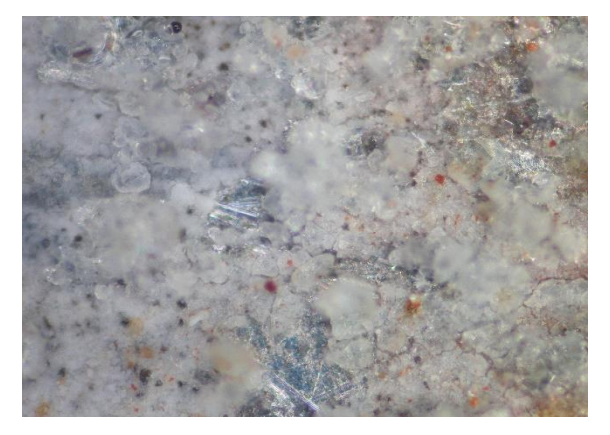
Fig. 3. Sample 5 - Area near the force application point, Magnification: 400X