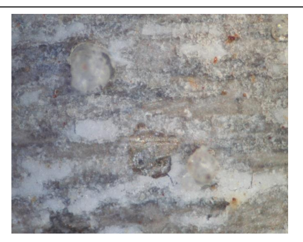
Fig. 5. Sample 5 - Macro aspect of the surface subjected to compression, Magnification: 100X