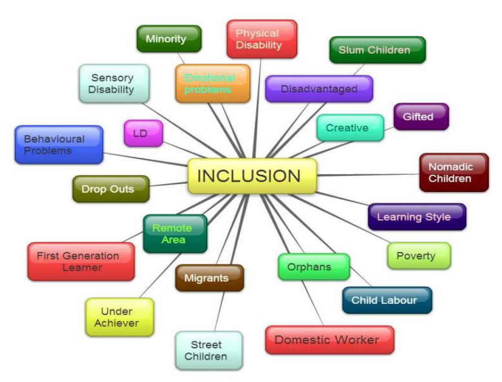
Fig. 1. Groups of children and persons identifying with inclusive education

Furthermore, according to the Law on Pre-school and School Education (LPSE), inclusive education can be synthesized as: