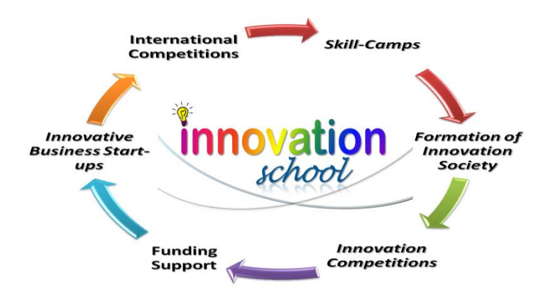
Fig. 2. Fundamental components of the environment in an Innovative School

One such alternative to the traditional ones are precisely the so-called "innovative schools", not only when it comes to technical, computer and digital resources, which by default are accepted as such, but also those with a new model of behavior, of teaching, of a vision regarding the interactions and relationships between the two groups of participants – the trainers and the trainees. Figure 2 shows a schematic view of some of the fundamental components of the environment in such a school.