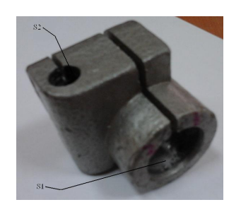
Fig. 1. Part with two functional surfaces

Furthermore, it is proposed a method which allows for the correlation of points from the surfaces measured in two distinct stages, respectively in two different positions of the same part. The method is based on the determination of the coordinates of three control points and then the establishing of the coordinate transformation upon which was obtained the modified position of the part to be measured.